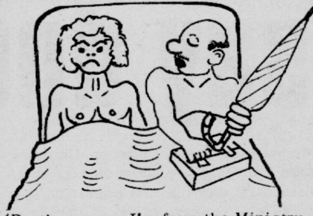
'By the way - I'm from the Ministry of Social Security.'

CHECK! the Liverpool organisation which helps social security claimants, has some forms to help people apply for exceptional needs grants for clothing and bedding.