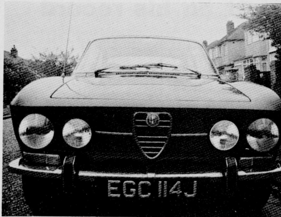
THE £2,000 CAR